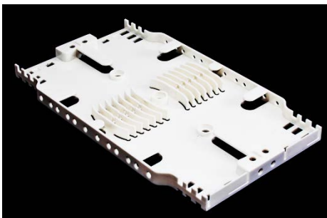
White Splice Tray for 24 splices