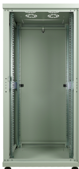
Front View Open