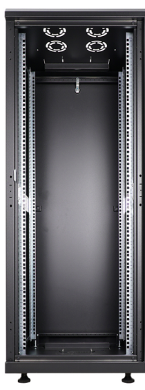
Front View Open