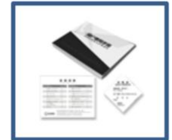
User's manual Quality Certificate Warranty Card