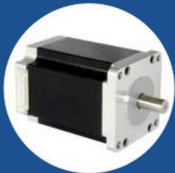
Siemens stepper motor