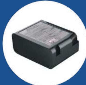
Sanyo lithium battery