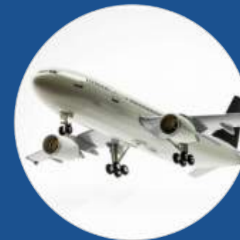
Aviation metal material