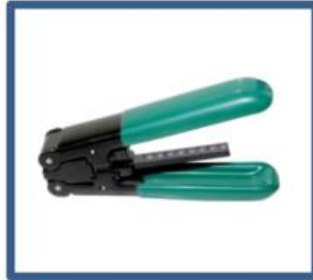
Wire stripping pliers