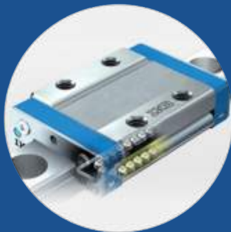
Roth ROUST linear guide