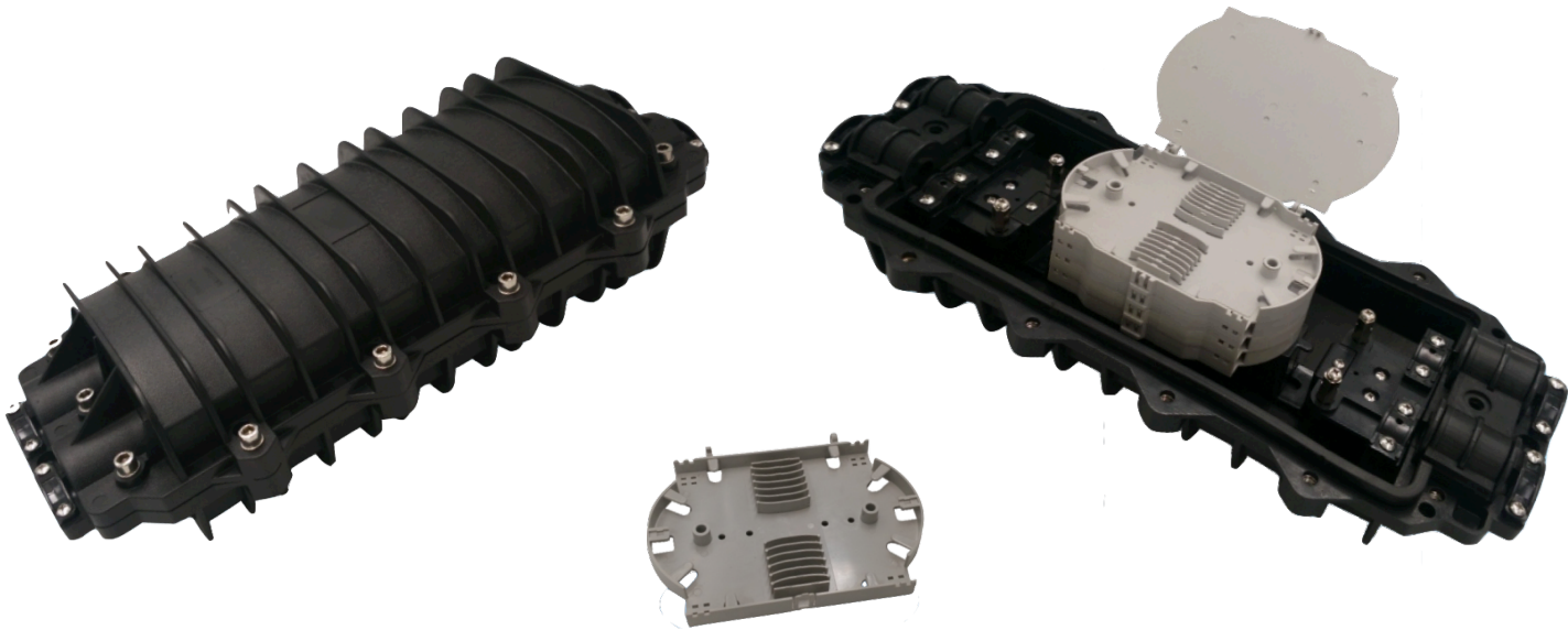
TYPE2 splice tray

Fumo’s universal re-usable closures of the SQ-6020 range for fiber optic cables are especially designed to protect cable connections in outdoor applications. They can be used with any cable construction and due to its robust structure and design, it withstands even harshest environments, as well as it’s ready for various fiber optic splice applications ( express, tap-off, branch, and repair ). The four cable entries of OV-6020/III can be used for cables with an outer diameter from 8 to 16 mm. The advanced robust design of the body and cover, carrying 1 slide-in-lock splice trays ( max. 24 splices in trays of L170xW120xH14mm and L160xW122xH10mm ), is protected by an elastic waterproof sealing. Accordingly, the closure can be easily re-opened and securely re-closed. In addition, SQ-6020/III has excellent features, such as a high mechanical firmness, acid & corrosion resistance, absolute water-tightness, as well as no special tools and trainings are required for handling and montage.