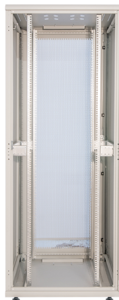
Front View Open